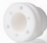
Jet Application of abrasive suspensions (Ceramics industry)