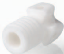
Jet Application of abrasive suspensions (Ceramics industry)