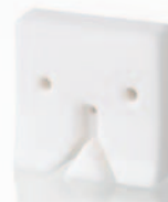
Assembly device X-ray technology