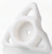
Soldering device Vacuum technology