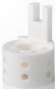
Soldering device Medical technology