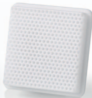
Catalyst carrier Biochemical engineering