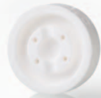
Fixing device screen printing Sensor construction